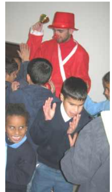
Students singing and dancing