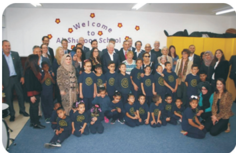
A memorial photo of the NSFVH Staff with the Canadian President and his wife