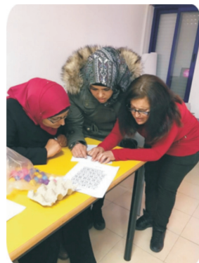
Implementing the concepts learned at the workshops by training 20 teachers from governmental mainstream schools.