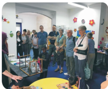
McCabe group on a tour to be more aware of the services provided by Al-Shurooq School.