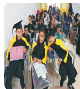
Principal of Al-Shurooq School giving certificates and gifts for fifth grade graduates.