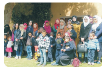
Mothers celebrating Mother's Day with their kids and enjoying several activities.

"In His great mercy he has given us new birth into a living hope through the resurrection of Jesus Christ from the dead." Peter 1:3