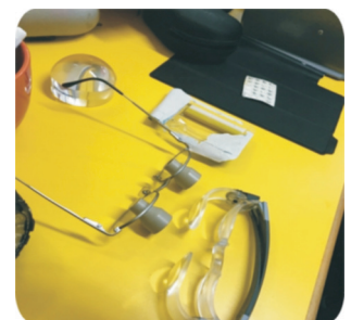
Some of the equipments in the resource room (magnifiers and readers)