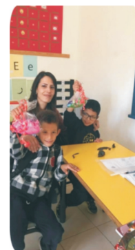
Al-Shurooq on eggs and receiving a gift full of colored eggs and Chocolates