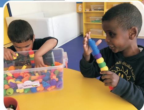
Students of Al-Shurooq enjoying their time at the toy library