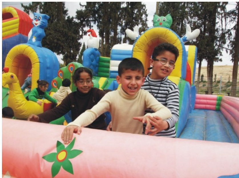
Children at the Banana Land - Jericho

Things at the school are going smoothly; the children are happy and studying hard. The School's annual outing took place on March the 25 th , and as usual the trip was to Jericho, being the warmest town to go to. They went to the park they had been to last year, to which some improvements had been made, and the children thoroughly enjoyed themselves trying the different games. They were lucky to have excellent weather, particularly as the previous day, it was terribly cold and stormy. Members of the staff did their best to give the children a lovely time.